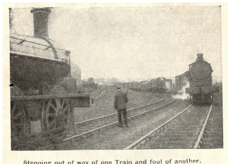
Stepping out of way of one Train and foul of another.