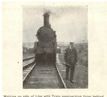
Walking on side of Line with Train approaching from behind